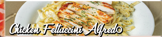
Chicken Fettuccini Alfredo