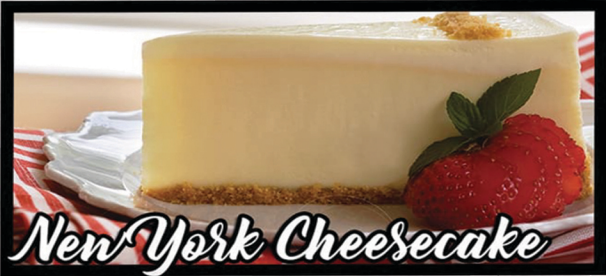
New York Cheesecake